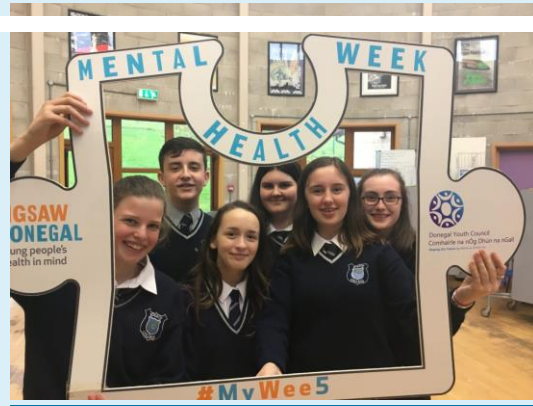
Students celebrating Mental Health Week in the College.