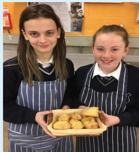
Home Economic students displaying their baking skills.

The Student Council is the representative structure for students, through which they can become actively involved in the affairs of the college, working in partnership with school management, staff and parents for the benefit of the college and its students. The Student Council gives students an opportunity to voice their opinions and concerns on day to day issues and make a real difference for school improvement. Students are elected to this council.