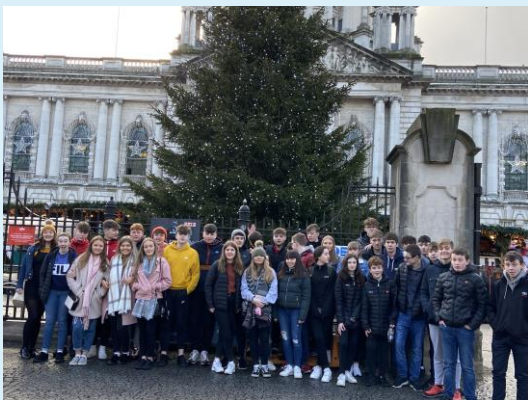
Transition Year students on a trip to Belfast, Christmas 2019.

The Parent's Association is the structure through which parents of students in the college can work together for the best possible education for their children. The Parents' Association works with the Principal, staff and the Board of Management to build an effective partnership between the home and school. The Parents' role in this association can be highly effective in advising the College's management on important issues and fostering good relations among all partners.